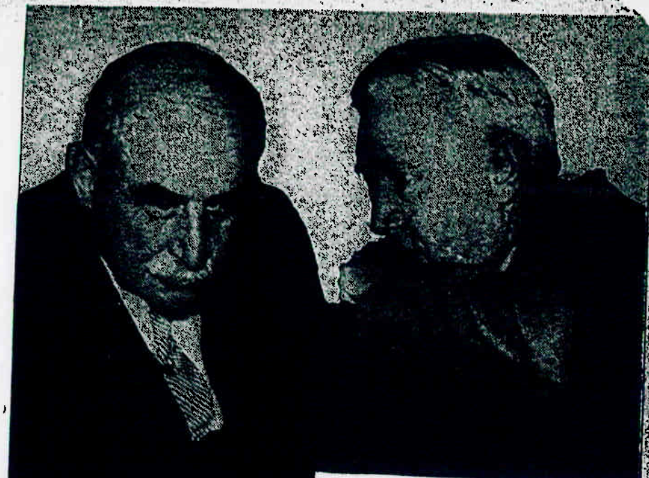
J. P. MORGAN Ultimate fountain-head of the whole fascist conspiracy of Wall Street