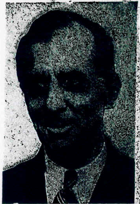
GEN. SMEDLEY D. BUTLER Who turned down this particular offer of a ride on a white horse

On July 27, 1934, he deposited $39,106.78. On July 27, 1934 (the same day) he again deposited $97,766.94.