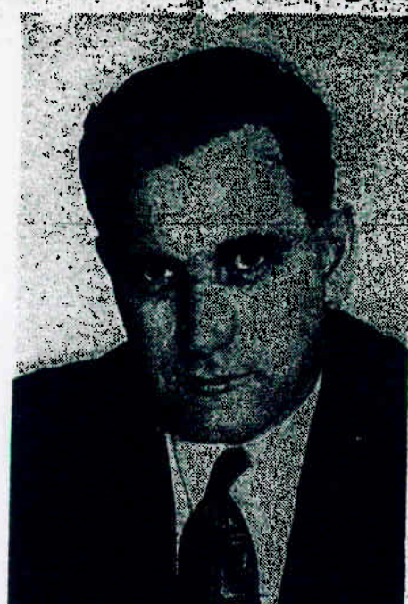
JOHN W. McCORMACK

Whose "investigation" of Fascism was steered by Warburg and his financial interests