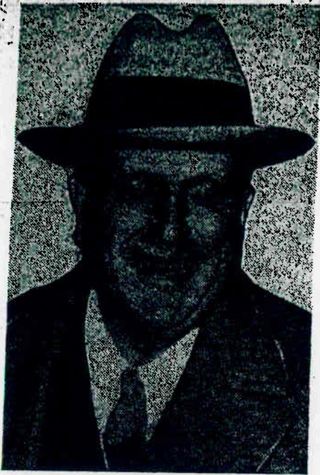
WILLIAM RANDOLPH HEARST Red-hunter-in-chief, boss of the American Legion, who nurses the fascist plot

many more millions available if necessary, is now on a campaign to get 4,000,000 members—a powerful band if properly financed by the country's leading financiers.